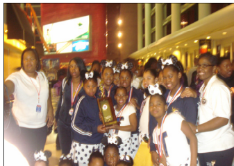
Divas After Florida Victory

The Titan Divas 12 & under step team are the 2008 American Youth Cheer National Step Champions. After winning the city title, the