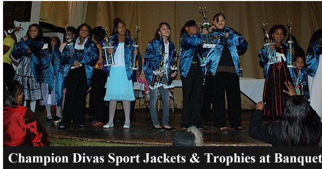
Champion Divas Sport Jackets & Trophies at Banquet

(Continued from page 1) was a once in a lifetime experience for the 13 member Titan team. The girls built close and deep relationships that have endured well beyond their return from Florida. The trip was